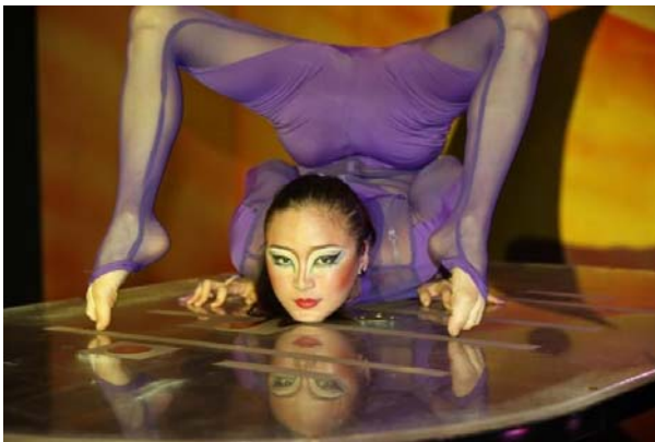
Cirque Polynesia Cast Member

Cirque Polynesia is Hawaii's one and only cirque show. The new 60-minute show features some of the world's best cirque artists from Mongolia, Chile, Peru, Brazil and the U.S.A., including Hawaii.